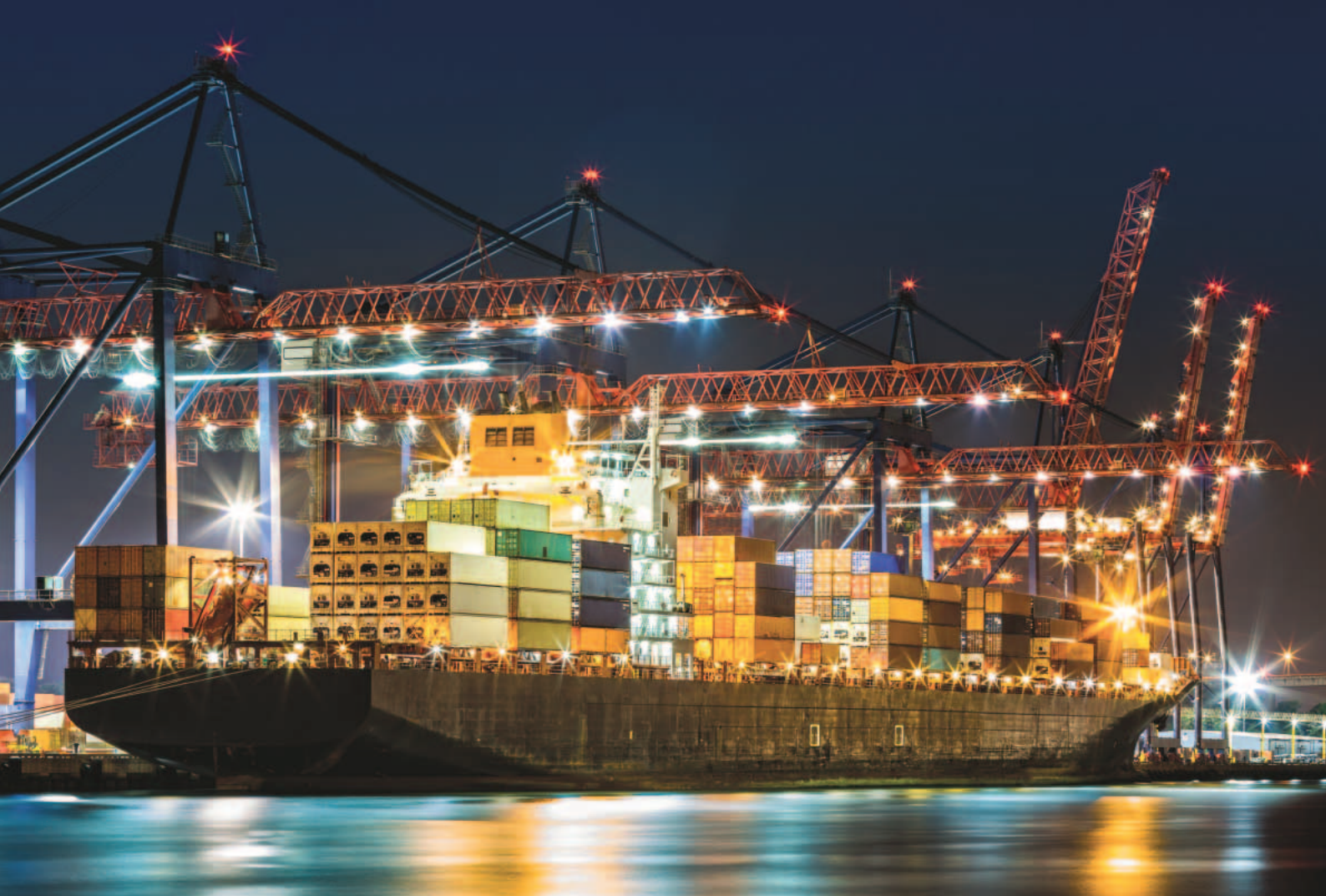
CARGO SHIP LOADING AT CONTAINER TERMINAL