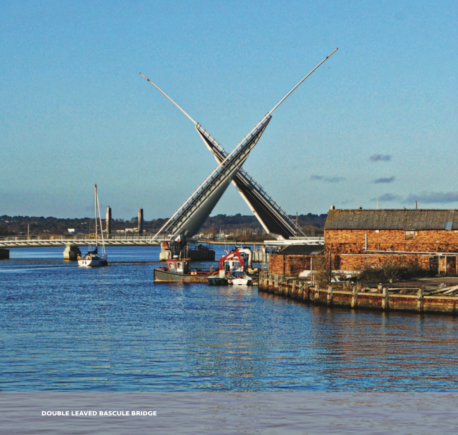
DOUBLE LEAVED BASCULE BRIDGE