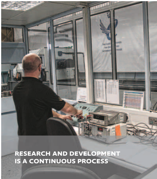
RESEARCH AND DEVELOPMENT IS A CONTINUOUS PROCESS