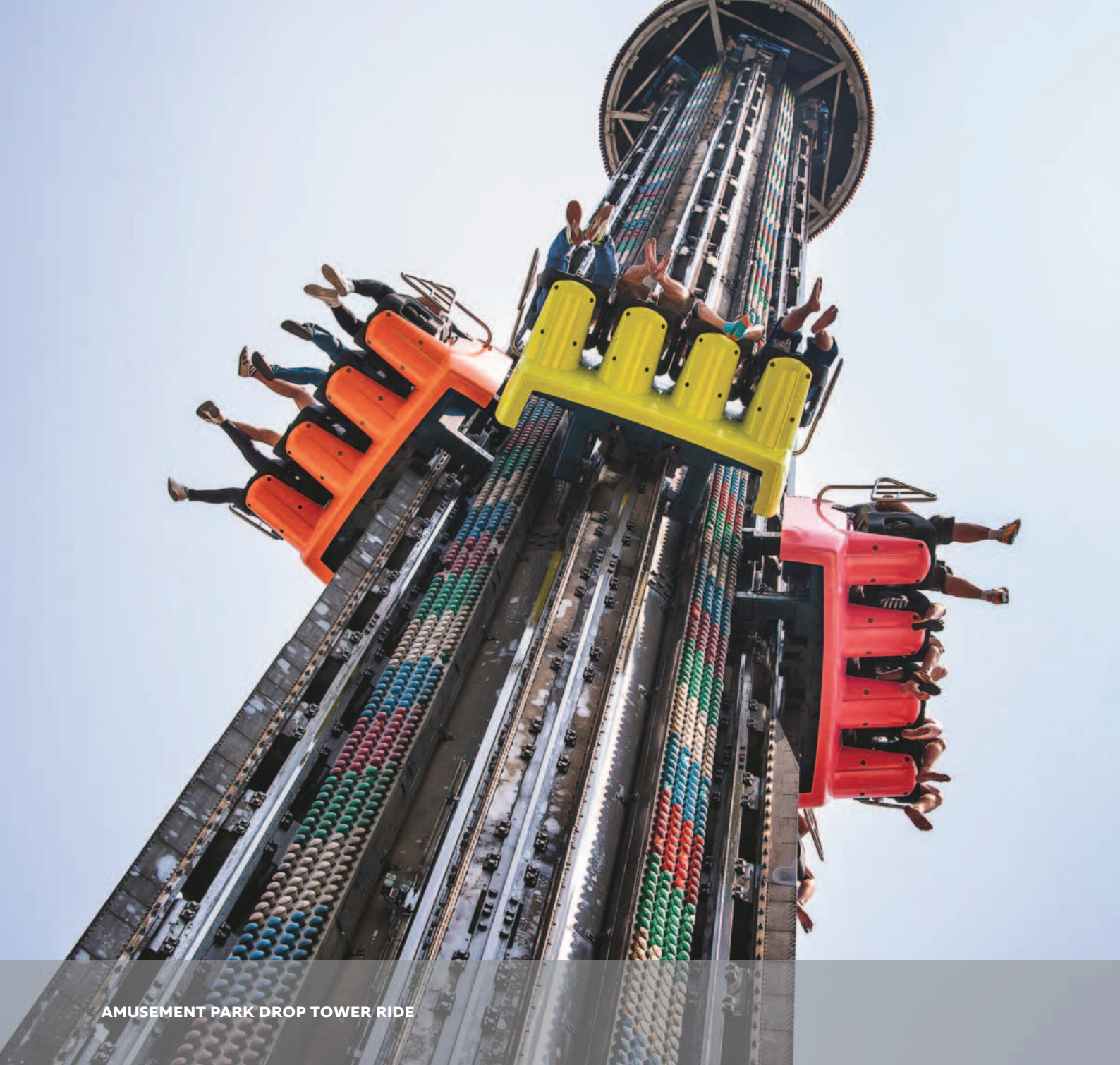
AMUSEMENT PARK DROP TOWER RIDE