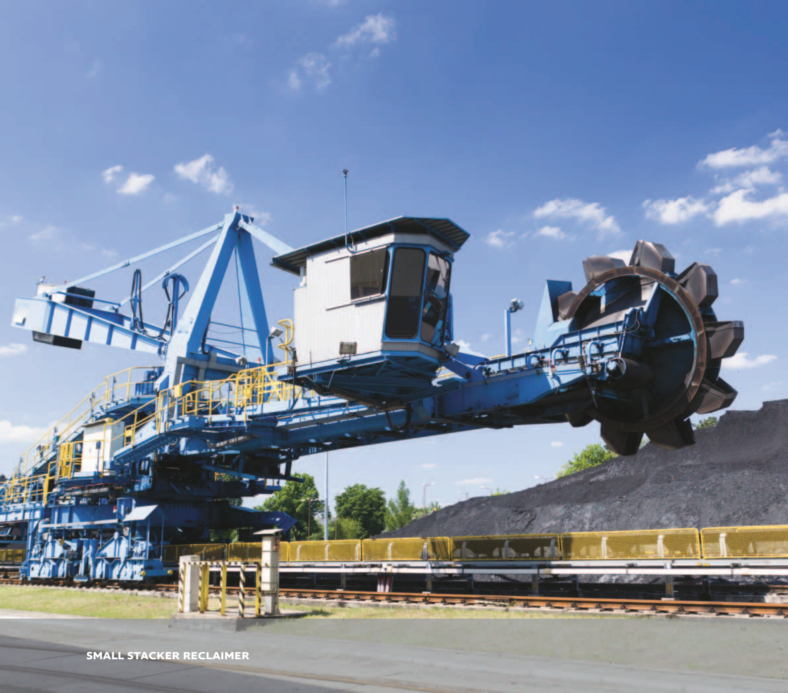
SMALL STACKER RECLAIMER