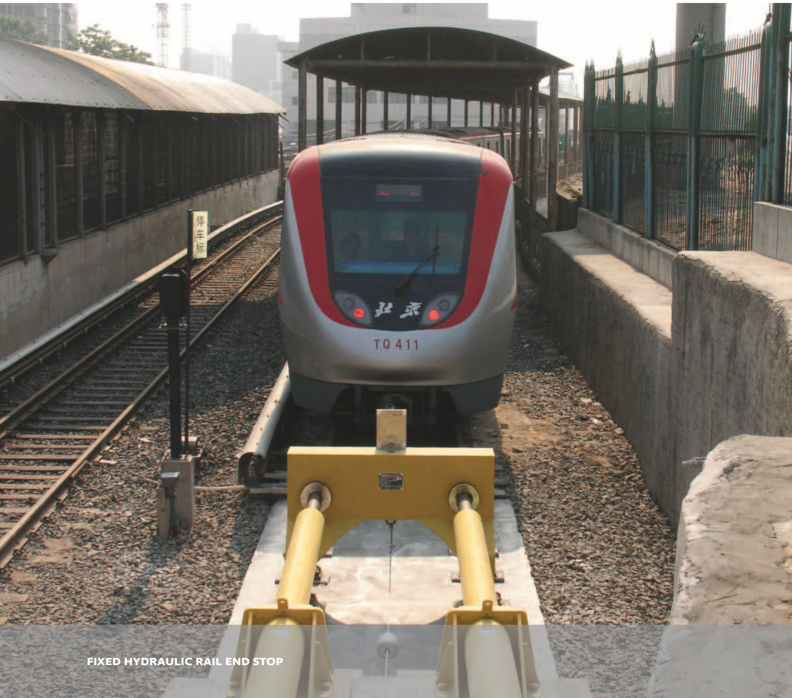
FIXED HYDRAULIC RAIL END STOP

in depth understanding of train performance through train running and impact simulations, ensuring efficient and effective end stop solutions are provided to the industry in the event of a train failing to stop. By dissipating the impacting energy through friction clamps, gas hydraulic buffers or a combination of both, each solution is optimised to provide the lowest deceleration rates whilst maintaining minimal installation distances.