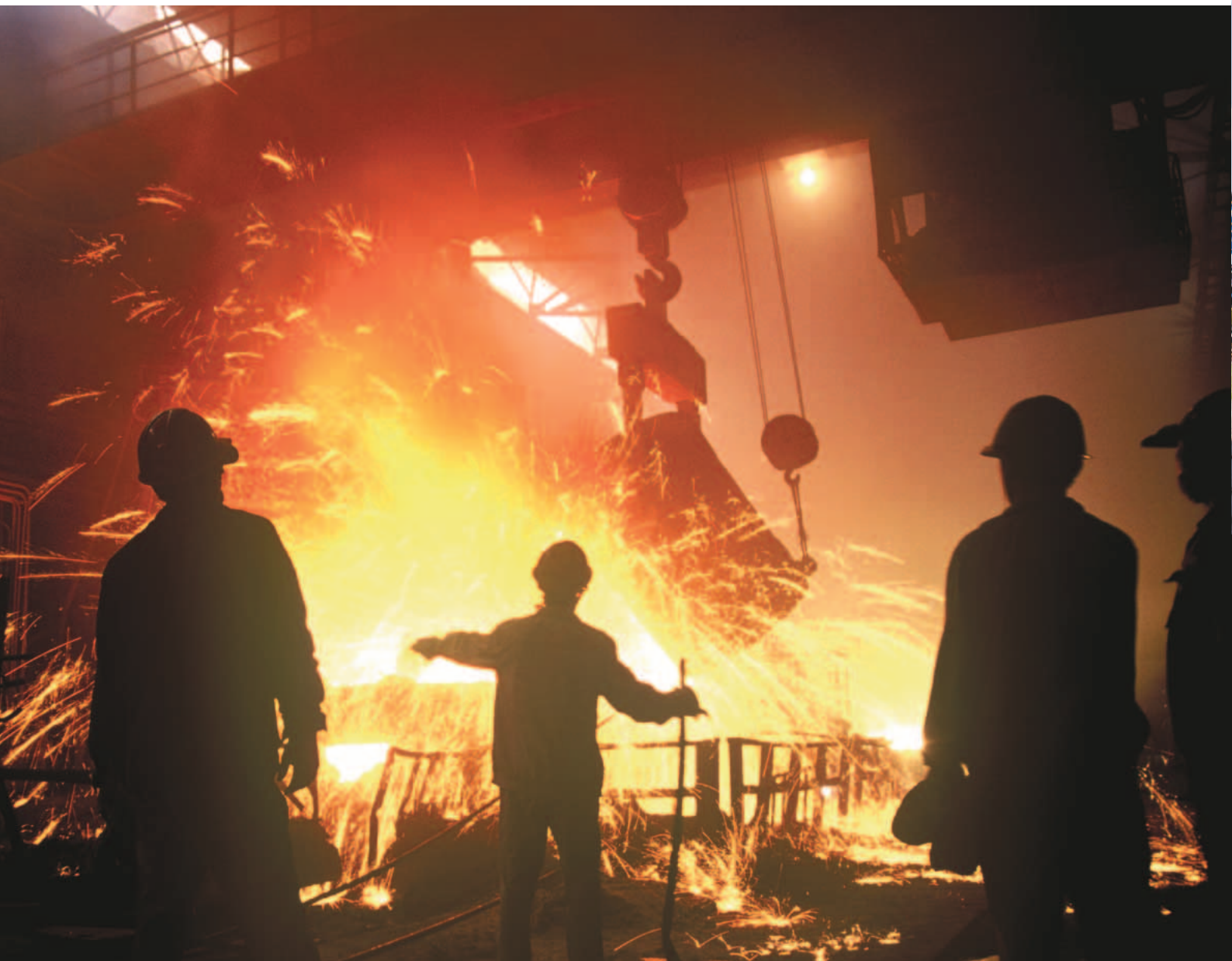
STEEL MAKING PLANT OVERHEAD CRANE